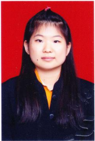
Nomor Pokok Mahasiswa/ Student ID 1-1405-027

beserta segala hak dan kewajiban yang melekat padanya. with all the rights and privileges pertaining thereto.